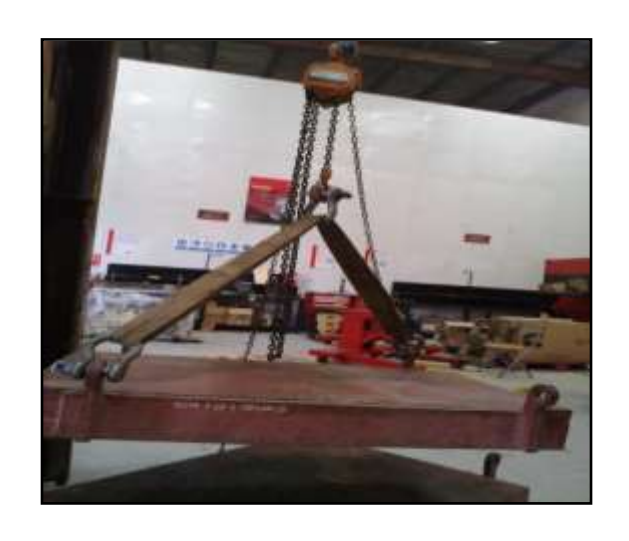
LOAD TEST OF CHAIN BLOCK USING CALIBRATED TEST WEIGHT.