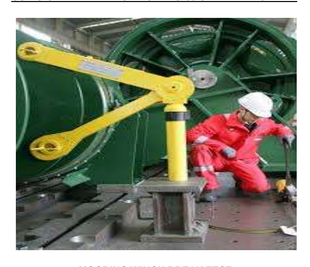
MOORING WINCH BREAK TEST