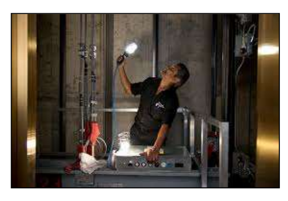
ELEVATOR SHAFT HOIST WAY CONDITION INSPECTION