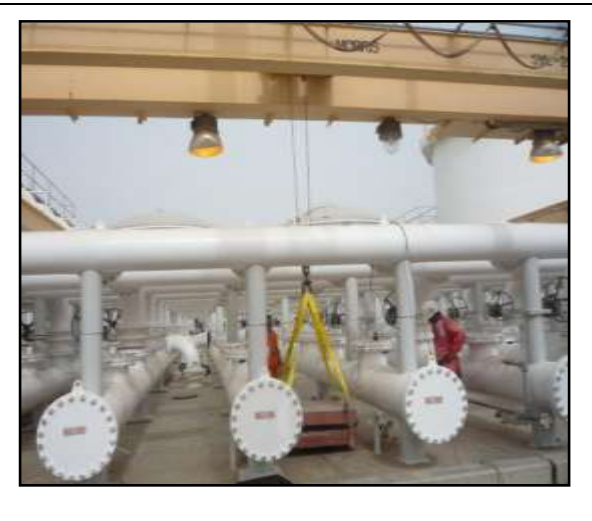
LOAD TEST OF OVERHEAD CRANE – USING CALIBRATED TEST WEIGHTS & LOAD CELL.