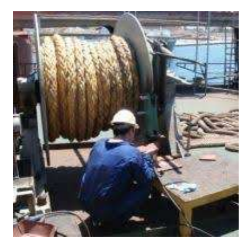
MOORING WINCH BREAK TEST