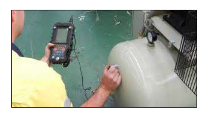
AIR RECEIVER THICKNESS TESTING