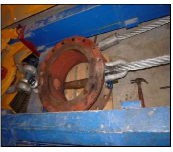
LOAD TEST OF LIFTING SPOOL PAD EYES @ 40 MT USING 75 MT TEST BENCH.