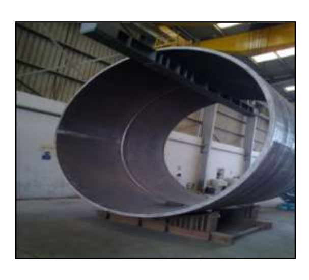
LOAD TEST OF LIFTING BEAM @ 45 MT USING CALIBRATED LOAD CELL & 60 OVERHEAD CRANE.