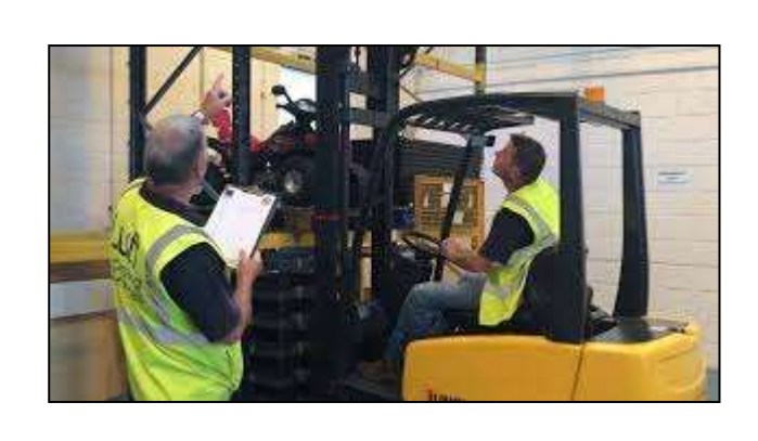
FORKLIFT FUNCTIONAL & LOAD TESTING