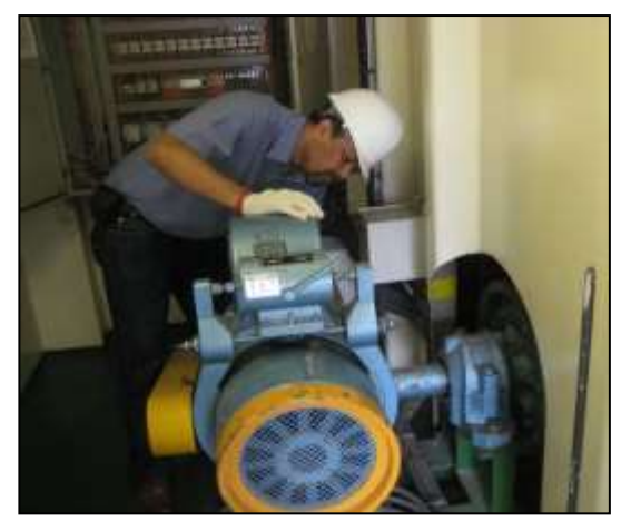
\frac{\textit{ELEVATOR VISUAL \& FUNCTIONAL TESTING INSIDE}}{\textit{THE MACHINE ROM}}