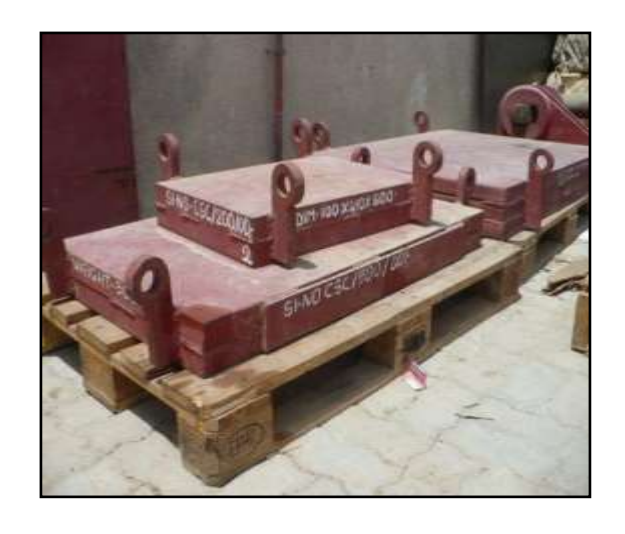
VARIOUS CALIBRATED TEST WEIGHTS – 200, 500 & 1250 KGS, etc