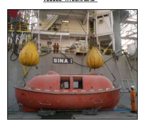
LOAD TEST OF GRAVITY TYPE LIFEBOAT DAVITS ONBOARD OILRIG "SINA1"