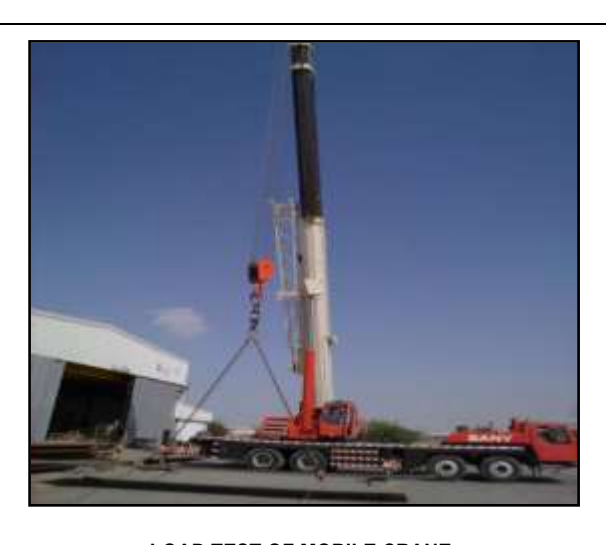
LOAD TEST OF MOBILE CRANE - USING CALIBRATED TEST WEIGHTS & LOAD CELL.