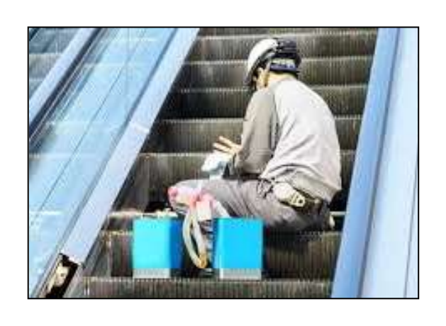
ESCALATOR AND WALKS OVER ALL VISUAL EXAMINATION