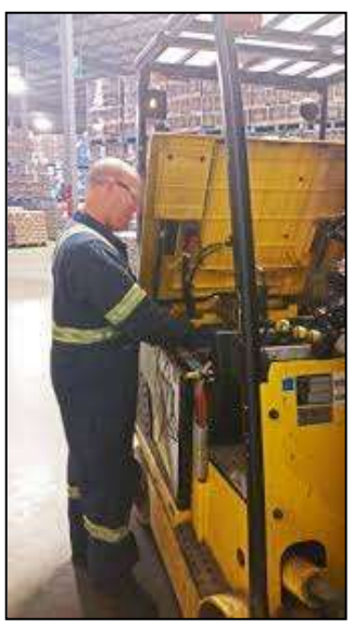
FORKLIFT VISUAL AND CONDITION EXAMINATION