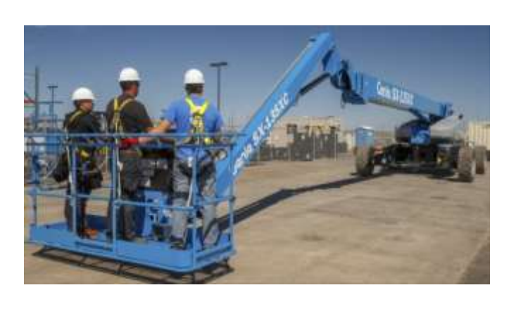
MOBILE ELEVATED WORKING PLATFORM MACHINE FUNCTIONAL TESTING