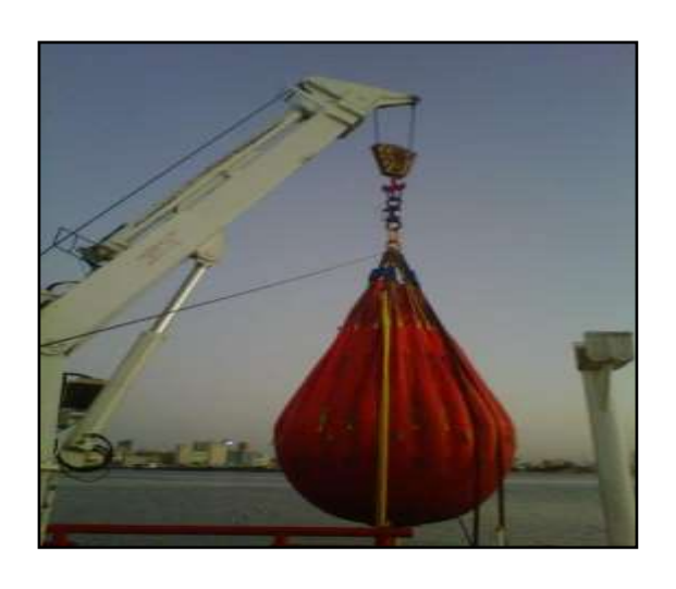
LOAD TEST OF DECK CRANE_ VESSEL "ONBOARD OFFSHORE SUPPORTER"