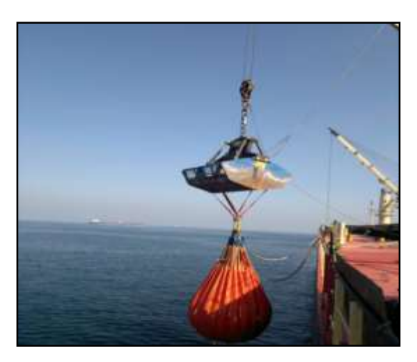
LOAD TEST OF GRABS ON BOARD VESSEL "HYDERABAD"