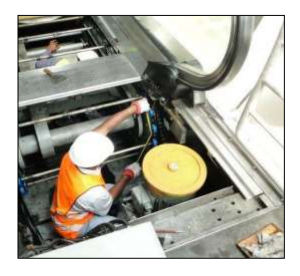
ESCALATOR & WALKS MACHINE FUNCTIONAL TESTING