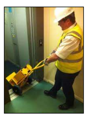
ELEVATOR LOAD TESTING